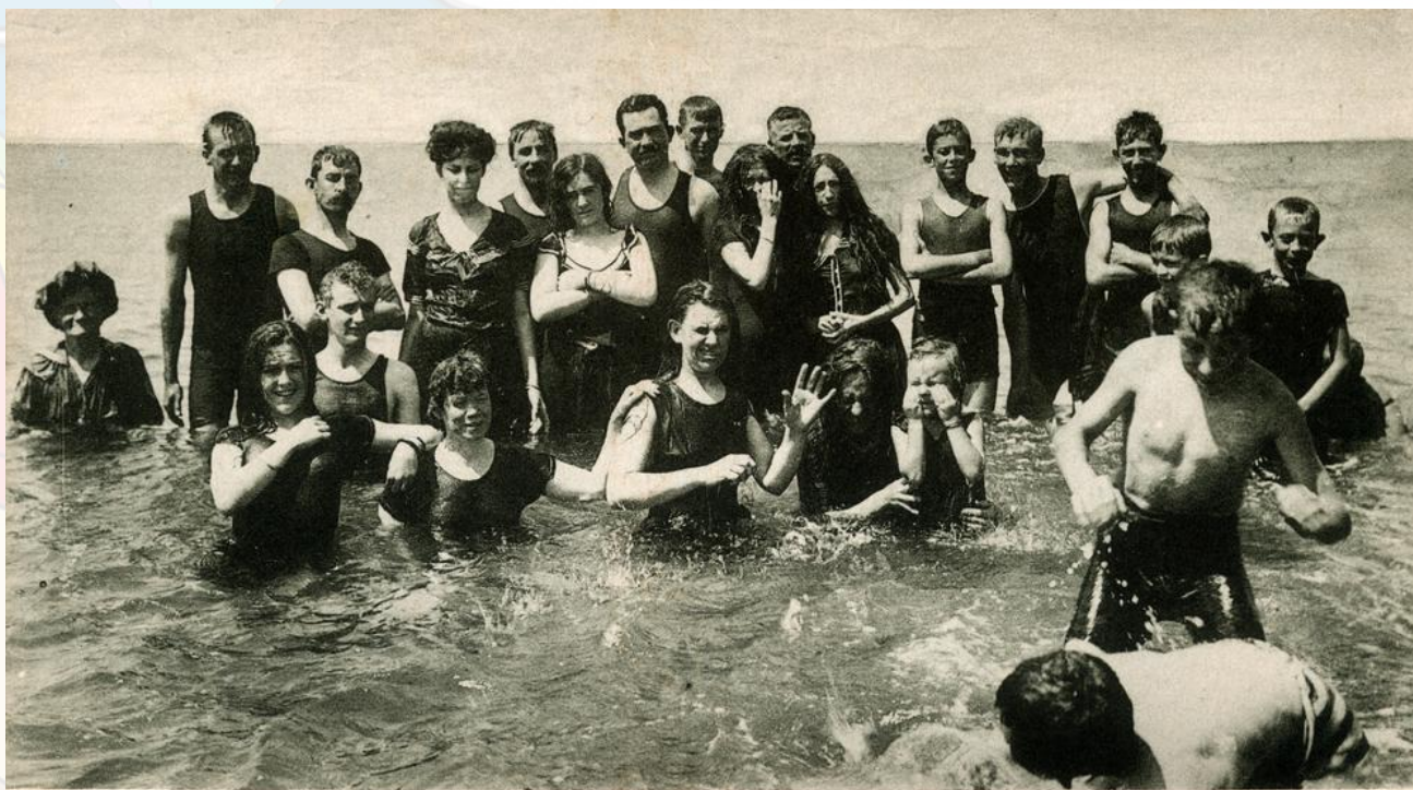
Mixed Bathing, Redcliffe, Qld.

Sunbathing wasn't in fashion back then, so Victorians would go to the beach fully clothed. 'Sea bathing' was done instead.