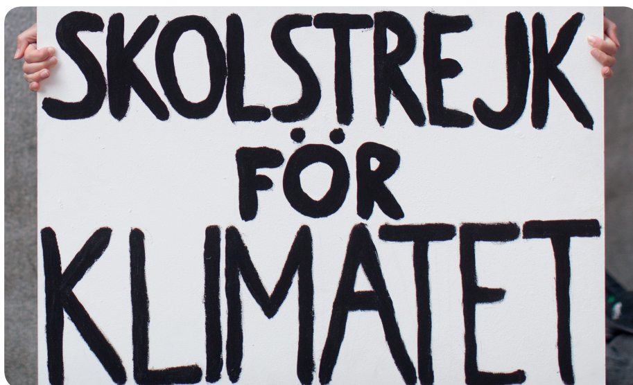
Skolstrejk för klimatet - School Strike for Climate

The issues of pollution and climate change were now being talked about more, because of Greta’s protests.