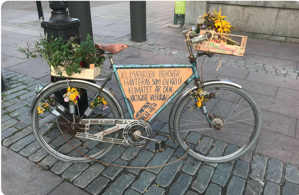
Greta's bicycle, Old Town, Stockholm

Not everybody wants to listen to Greta's message. There are many people who would lose money if laws are changed to protect the environment and they will often argue against Greta and attack what she has said.