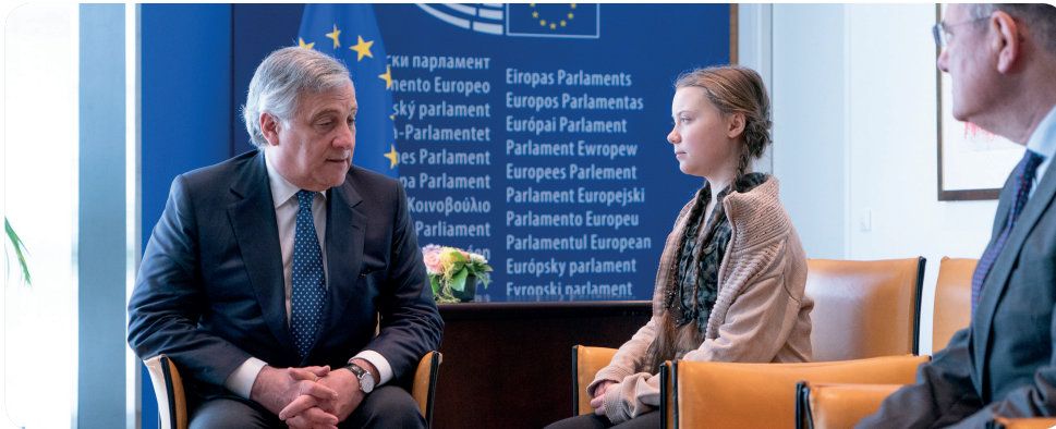
Greta Thunberg at Parliament

“You say you love your children above all else, and yet you are stealing their future in front of their very eyes.”