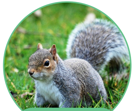
a grey squirrel