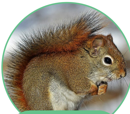
a red squirrel