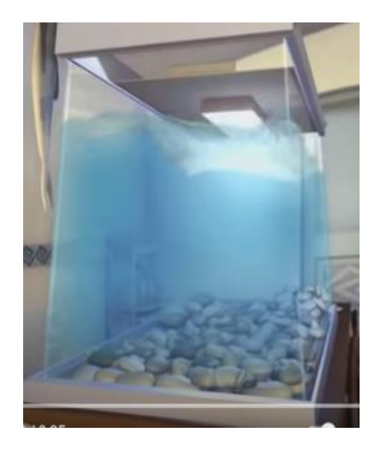
escapes gets out breaks out breaks free break loose makes a break for it