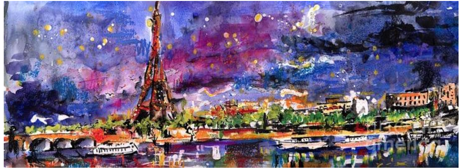
Paris- Eiffel tower