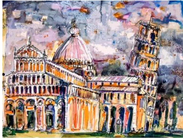
Italy- Leaning tower of Pisa