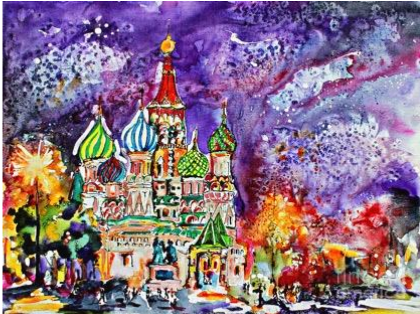
Russia- Saint Basil cathedral